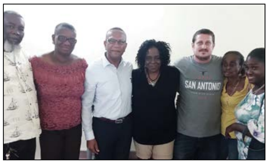
Members of the St Peters Emergency Organization Group and Minister of Education Hon. Wycliffe Smith.

SPEOG also stressed on the importance of 'We have to do for We" as it is important for us, as community members, to do as much as we can to ensure that our com-