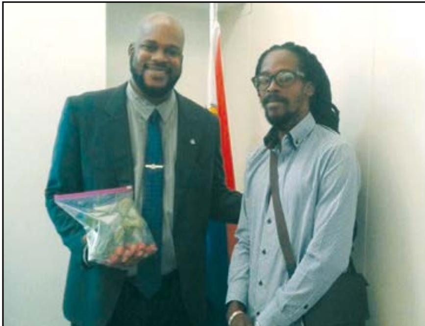
Sometime a smile is not what it seems, some will eat your food and don't care about the effort you took to grow it.

Please first understand what sole right is "Sole right - belonging or pertaining to one individual or group to the exclusion of all others; exclusive: the sole right to the estate. 4. functioning automatically or with independent