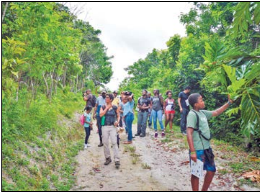
BirdLife Jamaica members and guests take a bird walk at Source Farm.