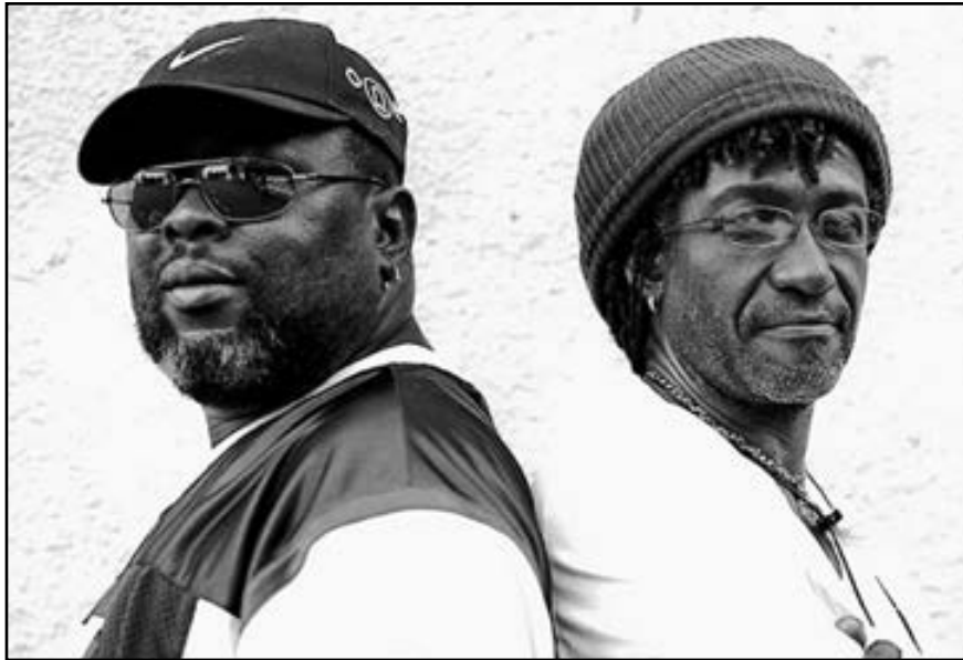
Bassist Robbie Shakespeare & Drummer Sly Dunbar

In 2003 they compiled and mixed a DJ mix album, Late Night Tales: Sly & Robbie, as part of the Late Night Tales series for Azuli Records. Far from restricting themselves to the Jamaican scene, (in which they have played for virtually every prominent Jamaican musical artist from Beenie Man to Sean Paul to Peter Tosh, Black Uhuru, Gregory Isaacs, Dennis Brown, Spanner Ban-