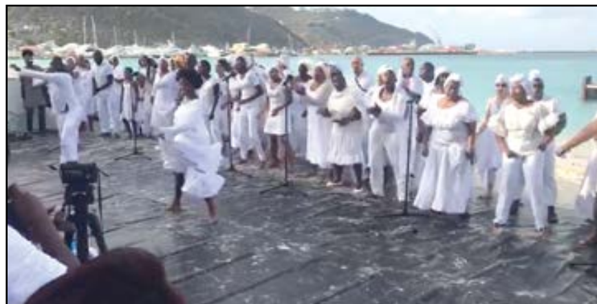
A dance of freedom