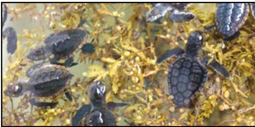
Loggerhead sea turtle hatchlings are shown at the Gumbo Limbo Nature Center before being taken to a U.S. Coast Guard vessel for release, Monday, July 27, 2015, in Boca Raton, Fla. More than 600 sea turtle were released onto free-floating sargassum seaweed offshore.

There is a limited amount of information available about Sargassum habitats because it is very difficult to sample. There is a need for further research into the history of mass Sargassum strandings in the