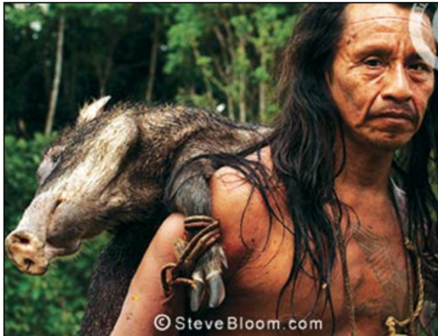
Indians, Yasuni National Park, Amazon

The growing industry of ecotourism in the Amazon lets travelers get an insider's view of this vast and lush landscape. The Association for Environmental and Cultural Preservation of Silves created Aldeia dos Lagos in Brazil to replace the unsustainable fishing practices of the people of the area. The organization focuses on educating visitors about local foods and lifestyle as well as how the Amazon impacts the rest of the world. The Rio Blanco Project in Ecuador provides ecotourists with a glimpse into indigenous life, and local guides offer tours into the rain forest.