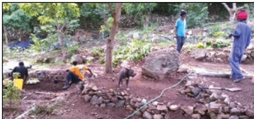
The elders and the youngster both keep each other motivated