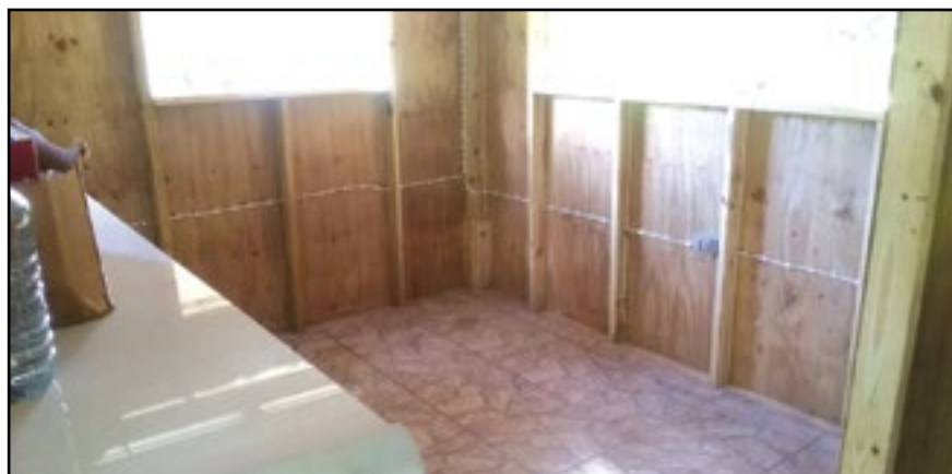
Harvesting and Preparation area constructed by trainees at the Skill enhancement Program