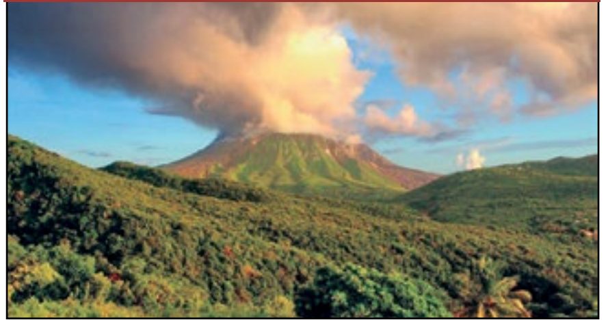
Montserrat's Soufrière Hills volcano

BY cntraveler AFTER YEARS of limited access due to volcanic activity, the island paradise of Montserrat is now accessible to cruisers.