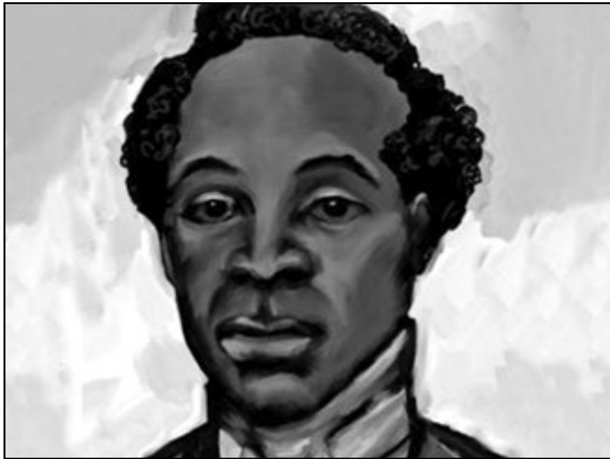
Mr Samuel Sharpe

Slaves learned that the British Parliament was discussing abolition of slavery; those who could read followed such news closely. In the mistaken belief that emancipation had already been granted by the British Parliament, Sharpe organized a peaceful general strike across many estates in western Jamaica to protest working conditions. As this was the harvest of the sugar cane, it was a critical time for the plantation owners: generally the workforce had to work overtime to process