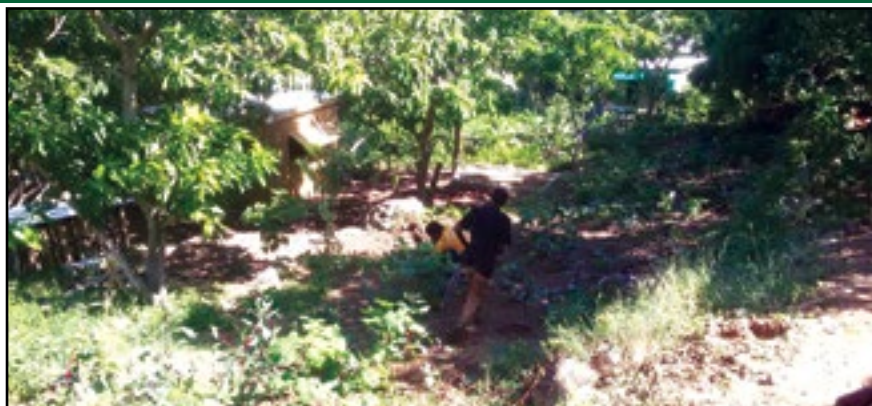
Trainees stabilizing plants after heavy rain fall