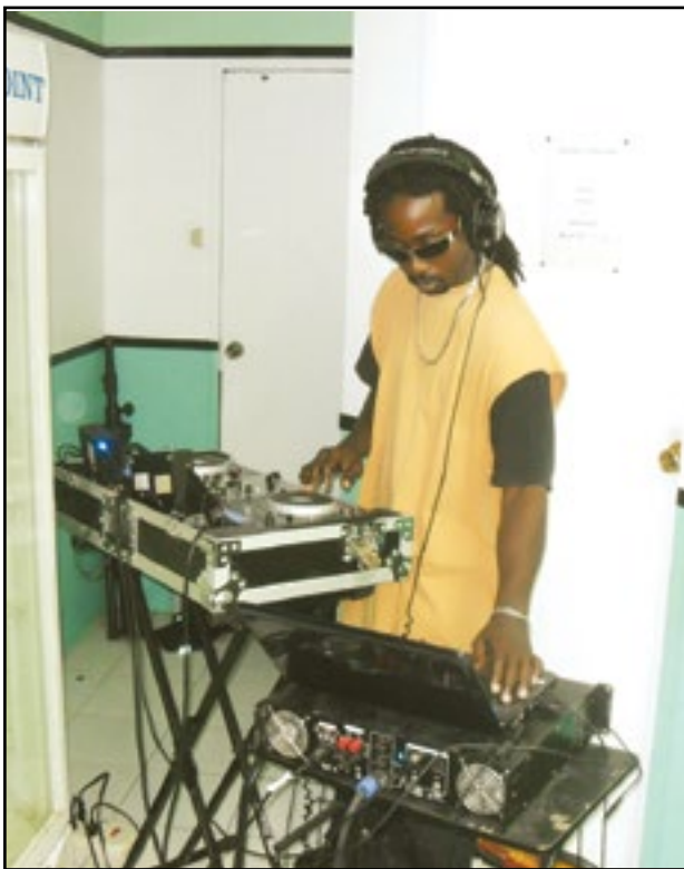
Messing with the ones and twos

I see agriculture as a highly nicety on St.Maarten not only because it will cause a mean of income