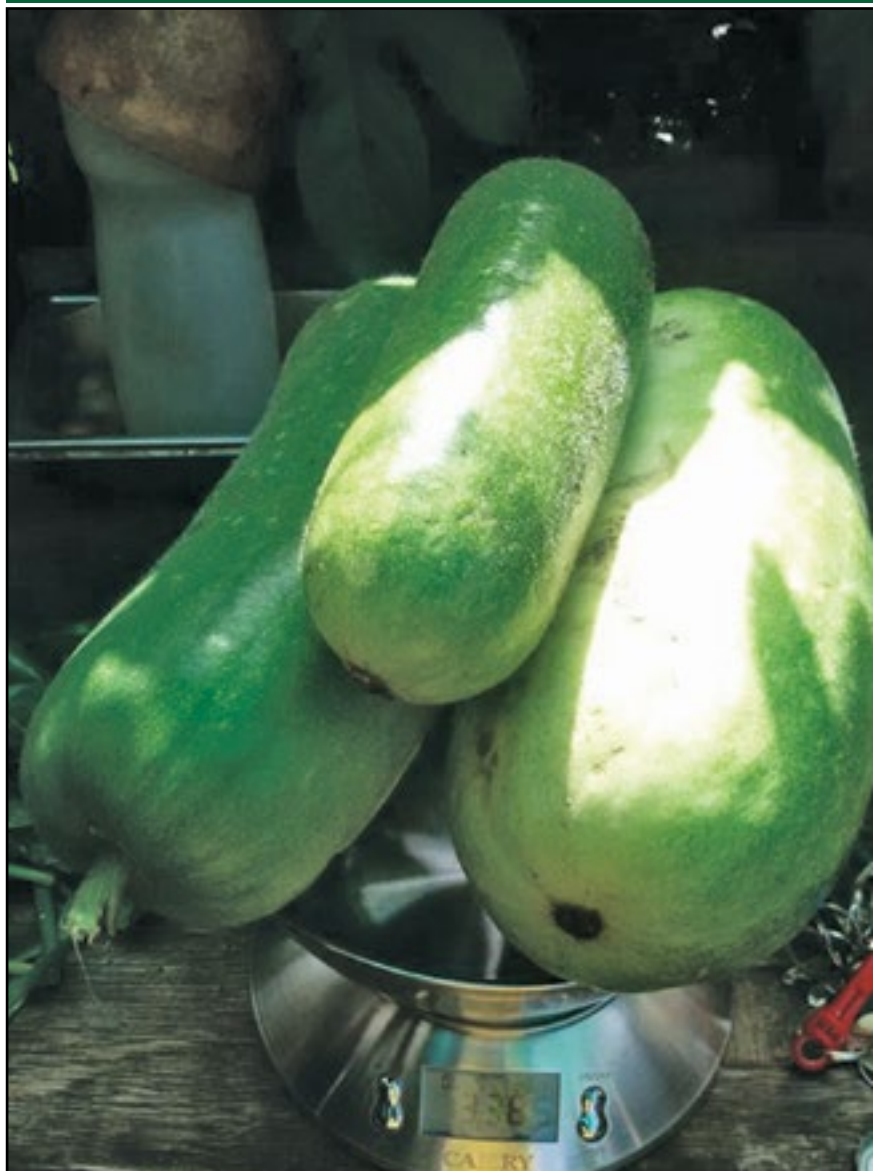
Large cucumbers weighing 3.3 Kilos