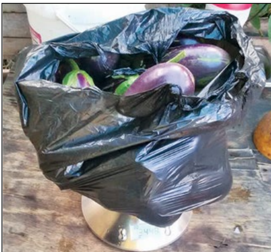
3.4 Kilos of Eggplant